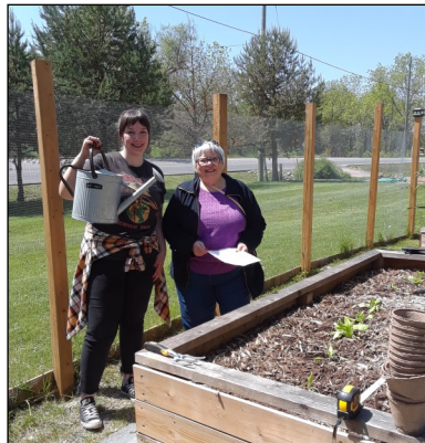
Victory Garden Planting and Watering